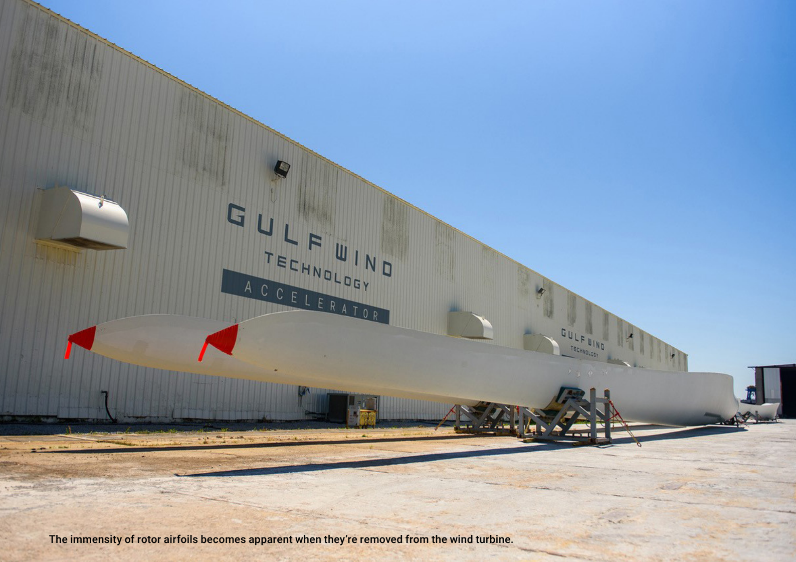
The immensity of rotor airfoils becomes apparent when they're removed from the wind turbine.

The process sounds straightforward enough, but it also poses another challenge: pushing the limits of airfoil design within the company's tight development schedule. Making wind tunnel models with traditional manufacturing is not a fast process and hinders the ability to iterate designs rapidly. When the objective is to optimize rotor design as quickly as possible, machining or molding wind tunnel models is not the answer because the time between the proposal and test of a new airfoil can be months. "That was the main reason why we wanted to have our own in-house, hurricane-capable wind tunnel, and why we want to manufacture our own test articles in-house," says Lotuaco. So for Gulf Wind Technology, making wind tunnel models with additive manufacturing provides the right approach.