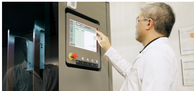
The Neo800 offers the large build chamber Gulf Wind Technology needs to print the wind tunnel airfoil models.

"It came down to the size of the parts we need to make and the material strength properties," Lotuaco notes. "We gave our chief engineer the data sheets for all the available materials and he analyzed which materials would be capable. The Somos® PerFORM Reflect™ material was the only one that met the loads we were expecting," says Lotuaco.